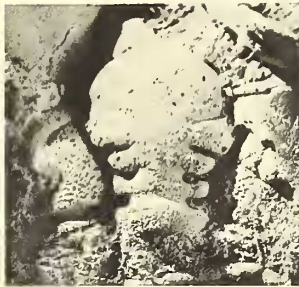
6 x 3.25